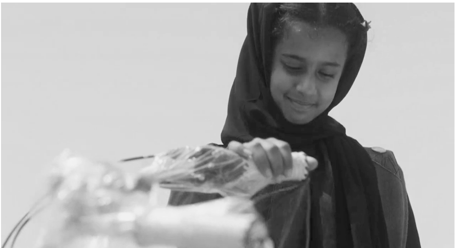
Fig 1: Wadjda decides to participate in a Qur’an-reading competition so she can buy a bike (WADJDA, Haifaa al-Mansour, SA/D 2013)

Wadjda (fig. 1) is a ten-year-old girl who wants to have a bicycle to compete with her neighbour and friend Abudallah, with whom she is not supposed to play because