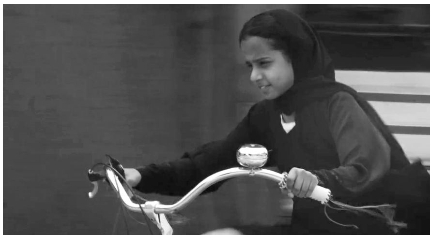
Fig 3: Wadjda's dream finally came true (WADJDA, Haifaa al-Mansour, SA/D 2013)

and who asks another woman to fulfil what seems to be one of her main duties, to provide a male heir for the family. In many ways, al-Mansour's film "calls the laws into question", 61 in terms of the right of women not just to perform usual tasks as do men, such as work or drive, but also to live as equals, freed from their exclusion and segregation. However, al-Mansour does not victimise women of Saudi society, 62 but instead cleverly reveals that patriarchal rules are often backed by women themselves: through the character of the strict schoolteacher, she shows that women can be the ones who (re)enforce these rules and support them. In a similar manner, she does not question Islam per se; Islam is not necessarily in conflict with the feminist perspective on gender equality and freedom, as we can see in the scenes when Wadjda prays with her mother. 63