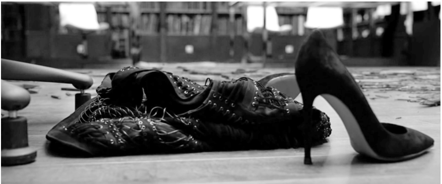
Fig. 2: Only her clothes, a memory stick and her voice remain. LUCY (Luc Besson, Fr 2014), 1:26:45.

shot of the film shows an overhead perspective; we hear Lucy's voice: "La vie nous a été donnée il y a un milliard d'années. Maintenant, vous savez quoi en faire" (Life was given to us a billion years ago. Now you know what to do with it).