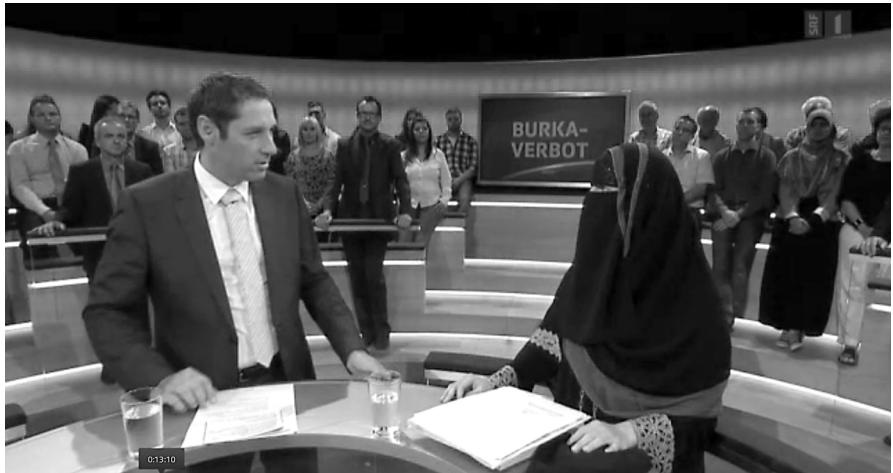
Fig. 1: Screenshot from Arena , a Swiss political talk show, 28 September 2013, © Elham Manea.

discussion in Arena , a Swiss political talkshow, and argues that her burqa is an expression of “free choice” (fig. 1). She says that the face of a woman, unlike the face of a man, is a source of temptation and that was a long process for her to come to this realisation, but in the end she chose to follow God’s will. The core of her argument runs, “This is my religion and I am exercising my right to freedom of religion.” 2