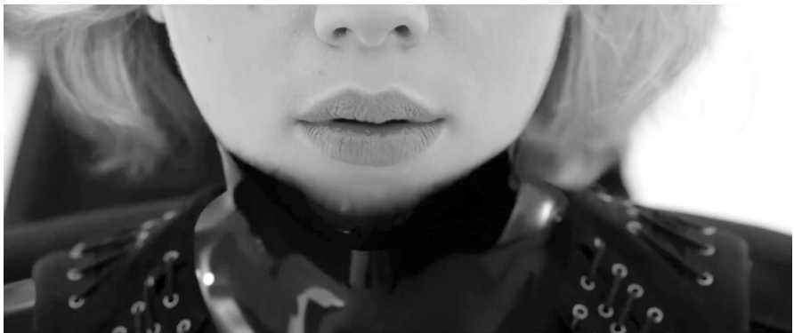
Fig. 1: At the end of the film, Lucy transforms herself into a black supercomputer. LUCY (Luc Besson, Fr 2014), 1:26:00.

We can illustrate these complex questions with the recent French science fiction film LUCY (Luc Besson, FR 2014). Lucy , a young woman played by Scarlett Johansson, gains supernatural cognitive and physical abilities through strong bodily contact with a nootropic drug, which was implanted into her abdomen. At the end of the film she transforms herself into a supercomputer (fig. 1, 2) and saves all her vast knowledge on a memory stick. Lucy becomes disembodied and disappears into a spacetime continuum. Besides her clothes and the memory stick, only her voice remains. The last