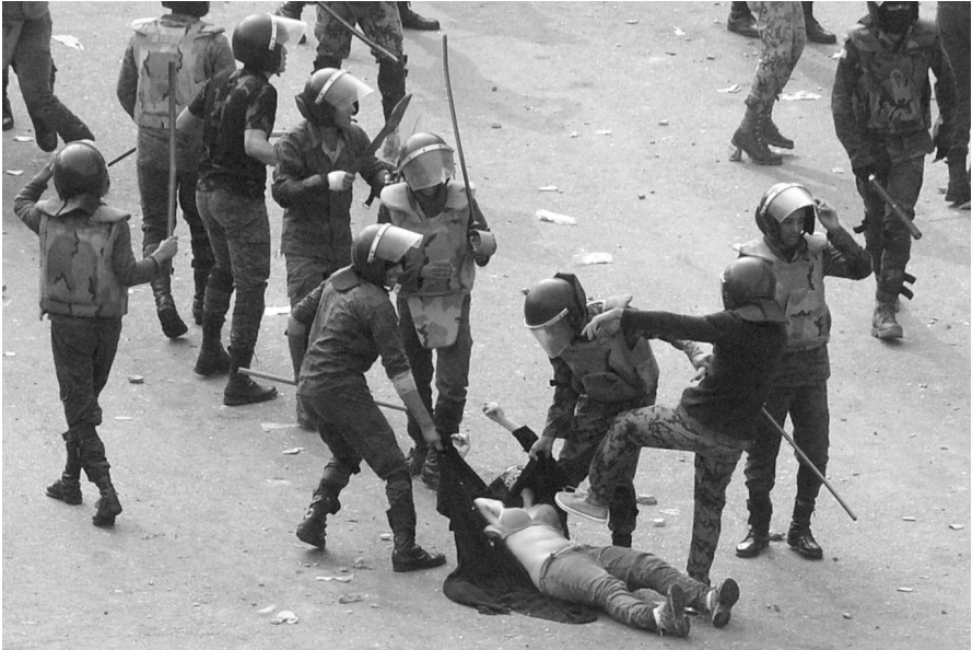
Fig. 3: The “blue bra” female protester beaten by Egyptian police during clashes in Cairo’s Tahrir Square on 17 December 2011 © Reuters.

Third image: A female protester is savagely beaten by Egyptian military forces (fig. 3). The woman was wearing a black abaya 3 but ironically is known only as “the woman in the blue bra”. The clip of the “blue bra incident” on 17 December 2011 shows a limp woman being dragged by her arms along the street with her abaya ripped open, exposing her naked torso and blue bra. Military forces surround her, many wielding batons; guards hit her, and one stomps on her. 4