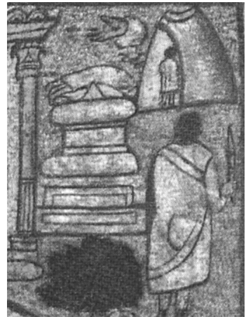
Fig. 1a (left): The Tora niche of the Dura Europos Synagogue.