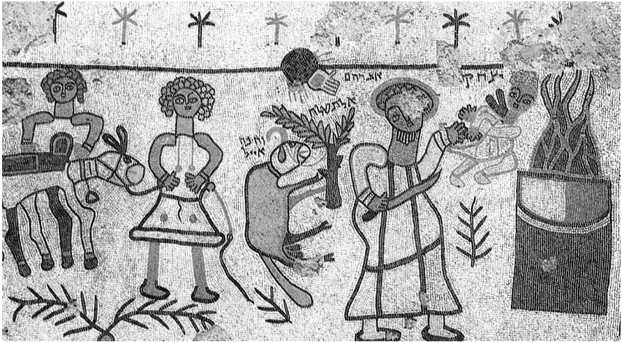
Fig. 2: Bet Alpha Synagogue – the hand of God prevents Abraham from sacrificing Isaac. Stähli 1988, 63.

widespread Jewish convention, persisting for hundreds of years, might be confirmed by the Beth Alpha synagogue mosaics (cf. fig. 2), located near Beit Shean in northern Israel, which date to the sixth century CE. 23 The existence of these Jewish pictorial images from disparate times and settings may dispel too narrow an interpretation of historical prohibition of visual images of God, for it appears that there has existed some scope within Judaism to depict divine action pictorially and anthropomorphically.