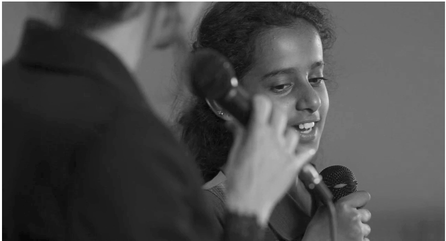
Fig 2: After winning the competition, Wadjda announces her plans to buy a bike. She gets told of and the prize money is withheld (WADJDA, Haifaa al-Mansour, SA/D 2013)

she is entering adolescence. Her mother, who is at the same time faced with a difficult emotional situation in her marriage, is initially opposed to her daughter's having a bicycle, and Wadjda therefore decides to enter a Qur'an-reading competition to raise the money she needs to buy a bicycle (fig.2).