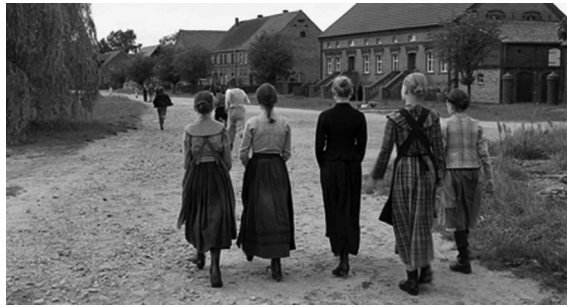
Fig. 1: A still representing the “objective” view on the world of THE WHITE RIBBON (Michael Haneke, DE/AT/FR/IT 2009), 00:17:08.