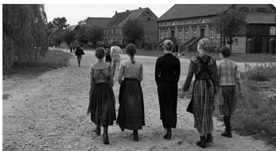
Fig. 1: A still representing the "objective" view on the world of THE WHITE RIBBON (Michael Haneke, DE/AT/FR/IT 2009), 00:17:08.