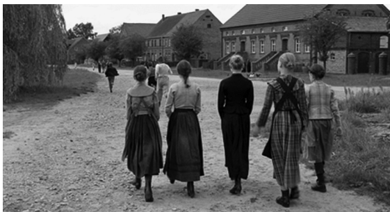
Fig. 1: A still representing the “objective” view on the world of THE WHITE RIBBON (Michael Haneke, DE/AT/FR/IT 2009), 00:17:08.