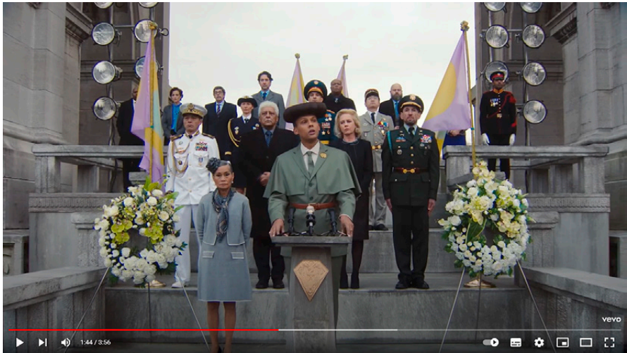
Fig. 1: Stromae, as the president, is holding a speech in front of other authorities. Music video still, Stromae, FILS DE JOIE (Official Video, Mosaert/Spotify, BE 2022), 00:01:44.

she deserves in a national tribute. At the same time, the scene of a pomp-filled funeral highlights the dangers of life as a sex worker. In just under four minutes, Stromae delivers a remarkable variety of imagery with “Fils de joie”. At the center of the video is the sex worker’s son, embodied by Stromae himself. He acts as the president of a fictitious state, delivering a eulogy to his mother. The ceremony contains numerous elements that are well-known to the viewer from great political or religious rituals. Important authorities from different countries are shown behind a grieving Stromae, different military troops perform an impressive choreography, and a column of black cars and motorcycles with mourning guests makes its way to the monumental location where the national tribute is to take place. And, of course, not to be missed from a ceremony of this kind: a grieving audience.