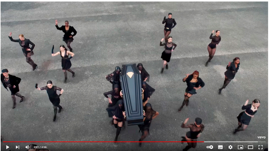
Fig 3: The group of sex workers carrying the coffin of her colleague. Music video still, Stromae, FILS DE JOIE (Official Video, Mosaert/Spotify, BE 2022), 00:03:01.

stockings. These women are not just attending the funeral to grieve or to be part of a “show”. They are sex workers who are having to bury one of their colleagues, knowing all too well how much injustice this life brings with it. At the end, the coffin is covered with the fictional country’s national flag to