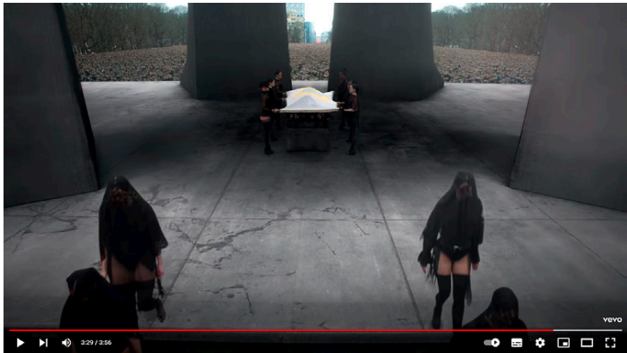
Fig. 4: The coffin is brought to the monument and covered with the national flag. Music video still, Stromae, FILS DE JOIE (Official Video, Mosaert/Spotify, BE 2022), 00:03:29.

pay last respects to the sex worker. The ceremony and the video close with military planes flying over the memorial.