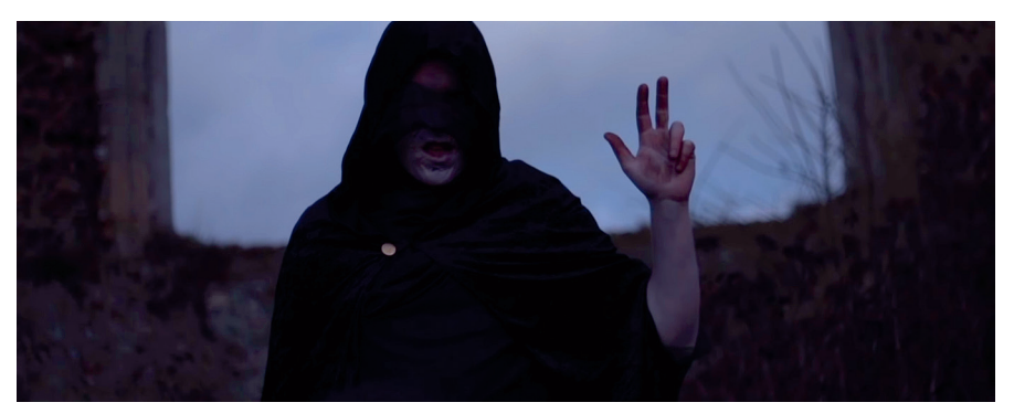
Fig. 3: Music video still from Asura's Realm, Venom Prison, 00:00:42.