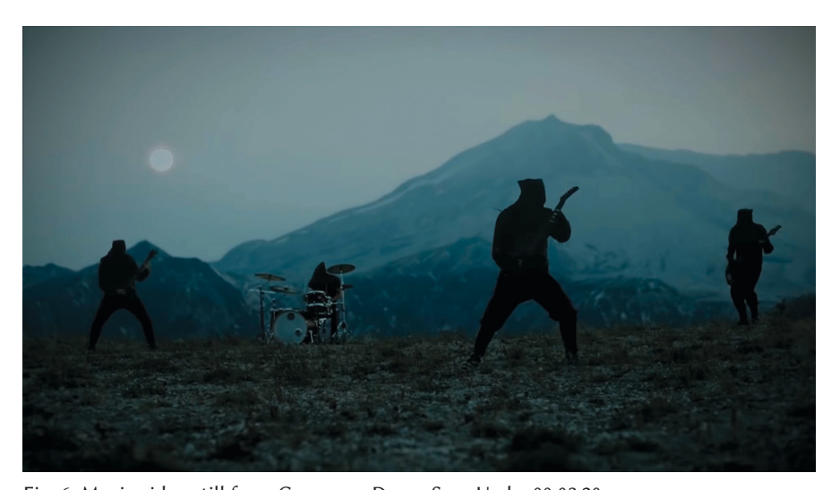
Fig. 6: Music video still from Cult of a Dying Sun, Uada, 00:03:20.

be interpreted as anti-modern in two ways: modernity is associated with urbanization, mechanization and rationalization, while the turning away from modernity is associated with nature, myth and irrationality. The reference to nature is also anti-modern when it arises from the connection between nature and paganism, specifically with the claim of (pre-modern, pre-Christian) originality. This claim is also fed by the Romantic conception of nature. There is no industrialized landscape in Romantic-era Kunstreligion