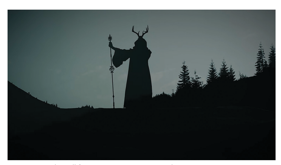
Fig. 4: Music video still from Cult of a Dying Sun, Uada, 00:02:49.

from guilt or consequences. A connection can be made between the idea of religion as oppressive and social systemic compulsion, with the motif of a priest-like cultic figure framed to accentuate authority. Beyond the visual support, the lyrics provide an allegorical reading of corrupt authority. Contrastingly, the priest figure in Uada's video is the sacrificing participant and enacts violence through the implied burning of the child (the bundle). The narrative of sacrifice turns into a "deal with the devil". The video description<sup>57</sup> names the figures as Mother/Ritualist and Djinn/Ritualist. Although