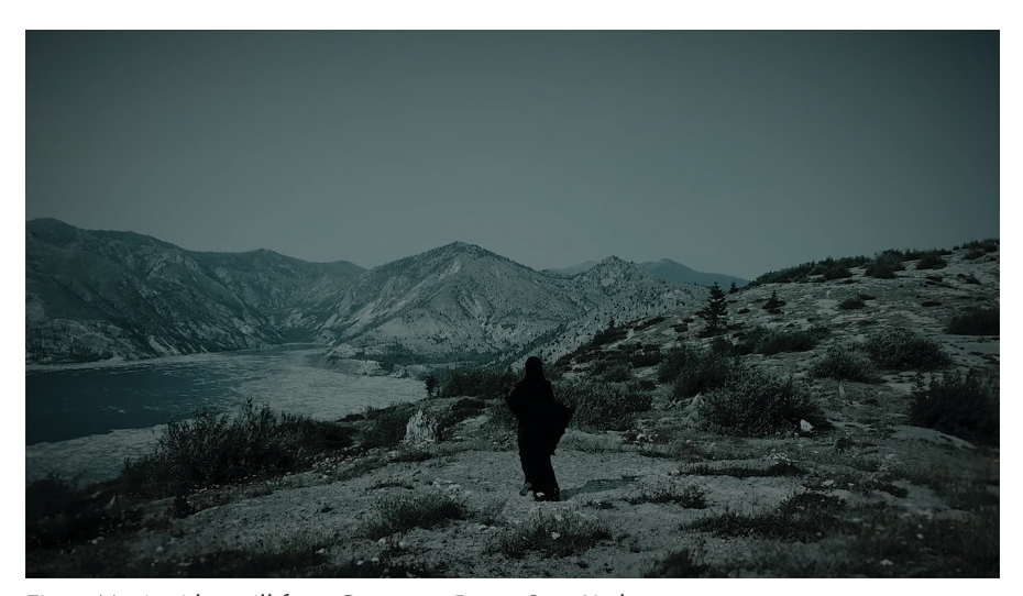
Fig. 2: Music video still from Cult of a Dying Sun, Uada, 00:06:50.

of walking scenes. Both scenes situate hooded figures in a much larger landscape.