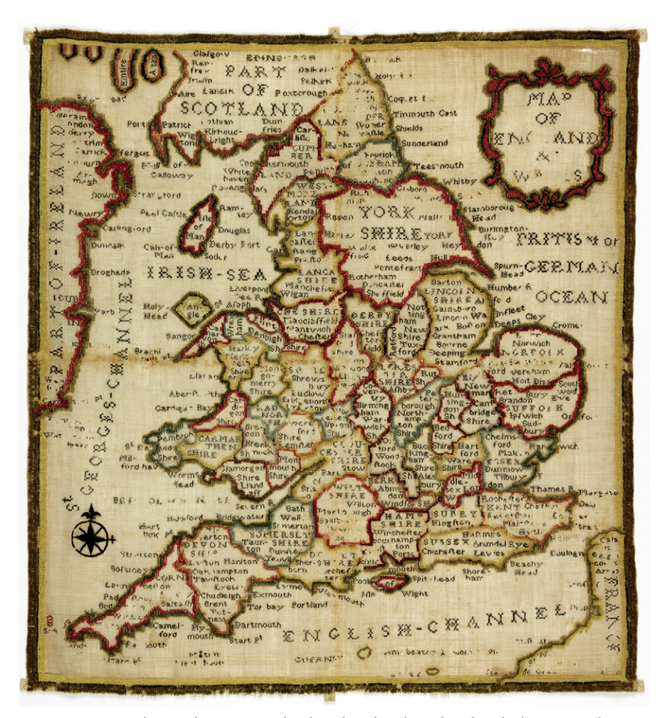
Fig. 4: Ann Seaton's sampler, 1790, England, embroidered wool with polychrome wool in cross, double back and satin stitch, height 52 cm, width 47.75 cm, Fitzwilliam Museum Cambridge T.166-1928.<sup>35</sup> This sampler belongs to the production made at Quaker schools in England and America in the 18th and 19th centuries.

Though the embroidering of samplers was widespread in all classes, it was considered a privileged "language" for teaching girls lessons such as basic arithmetic, reading, and writing (fig. 2). For this purpose, Bible quotations and moral or pious texts were often stitched (fig. 3).