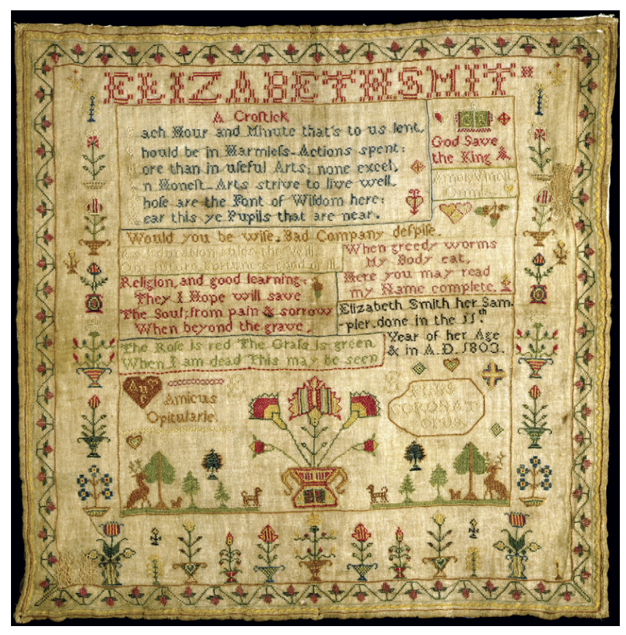
Fig. 3: Elizabeth Smith's sampler, 1803, England, embroidered linen with silk in cross stitch, V&A 942-1897.<sup>33</sup> This sampler is composed of various ornaments and texts. The words "When greedy worms / My Body eat, / Here you may read / my Name complete" allude to the sampler as a material memory surviving Elizabeth, who completed this work when she was 11 years old. "Religion, and good learning, / They I hope will save / The Soul from pain & sorrow / When beyond the grave" sums up in a few lines the ideals of female education in the 19th century.

charging much for the work, it might afford employment for the children and benefit the poor.<sup>34</sup>