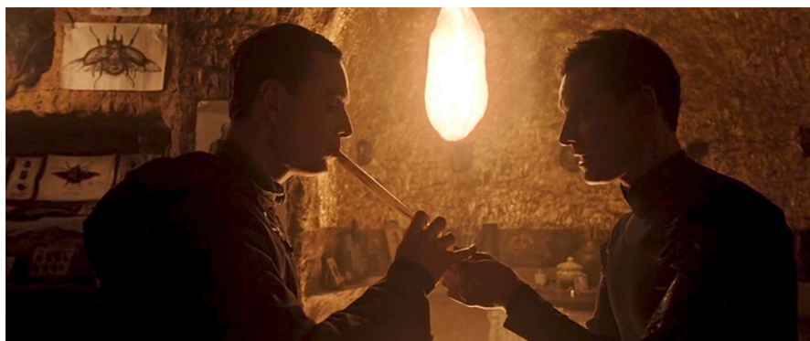
Fig. 2: Film still, ALIEN: COVENANT (Ridley Scott, US 2017), 01:04:37.

mechanical problem occurs. Part of the crew is reanimated to find out where they are. They meet David in a large cave and are confronted by evil creatures; after killing most of the reanimated crew, David takes control of the ship, directing it again to Origae 6.