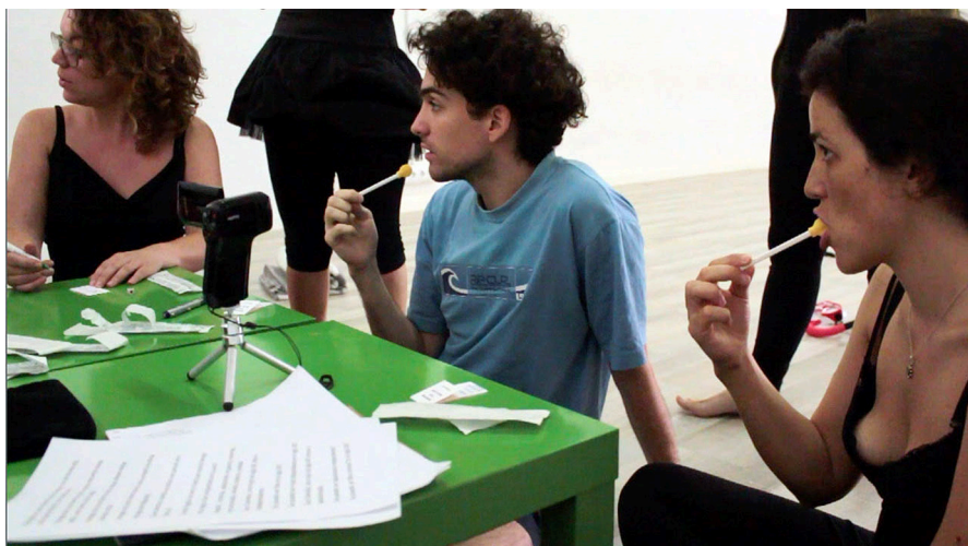
Fig. 3: The Mirror of Faith , 2014, University of Barcelona, http://boryanarossa.com/en/the-mirror-of-faith/ [accessed 27 December 2019].

Shaw and most of the crew of Covenant after they land on the planet, a place described by the robot himself as a “Paradise”. 11 In an allusion to Milton’s Paradise Lost , but in a much darker way, two stages of the creation (the Engineers and humanity) are melted then destroyed. Even then, David’s quest is not completed within this movie: he seeks to reach the ultimate creator, God himself, the One Elisabeth Shaw believed in even up to her death.