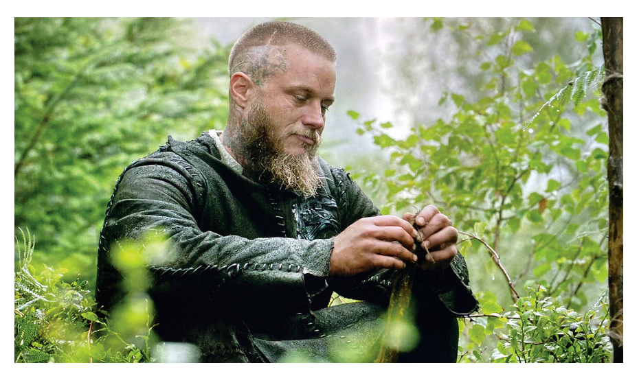
Fig. 6: Film still, VIKINGS, S3:E6 (00:43:38).