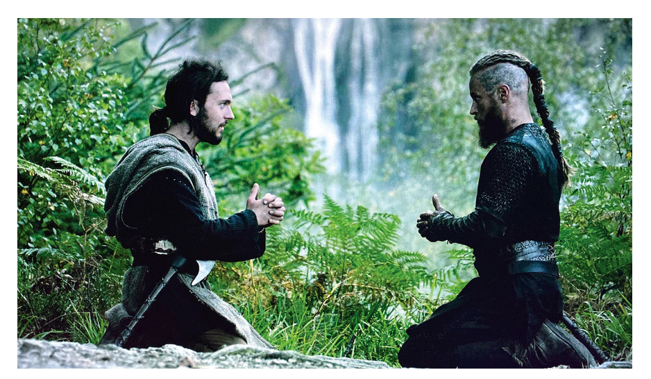
Fig. 5: Film still, VIKINGS, S2:E10 (00:33:50).