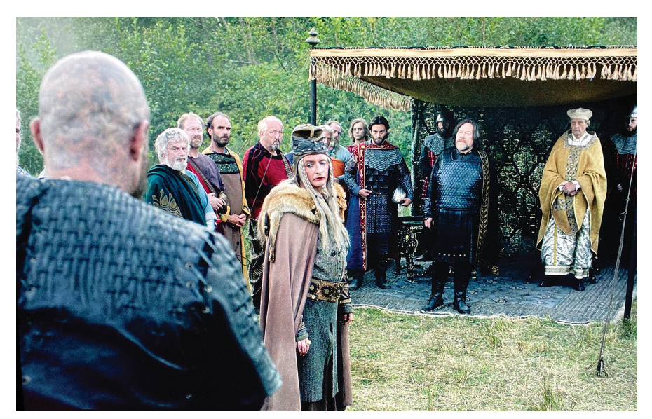
Fig. 7: Film still, VIKINGS, S3:E9 (00:40:33).