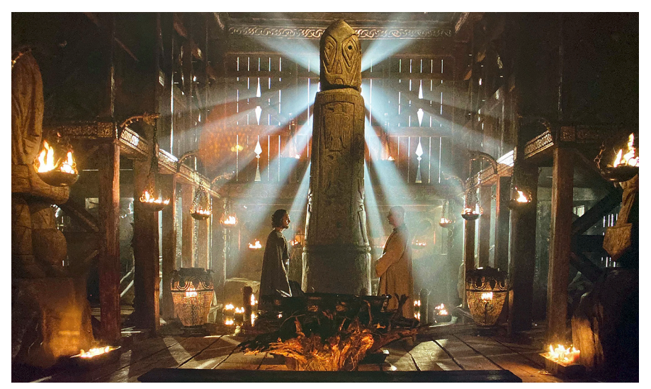
Fig. 2: Film still, VIKINGS, S1:E8 (00:35:07).