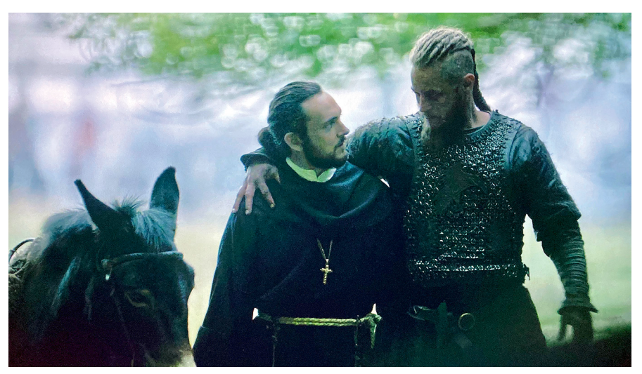
Fig. 4: Film still, VIKINGS, S2:E9 (00:27:49).

ongoing existential encounter between religions and of their interconnected convictions, beliefs and struggles. It ends with Ragnar's hope for a future friendship of the gods, a perspective more commensurate with diverse Viking religion than with contemporary Christian faith. The whole fragment serves as a metaphor for the peaceful coexistence of religions in the world of the viewer.