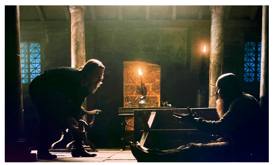
Fig. 9: Film still, VIKINGS, S4:E14 (00:31:48).