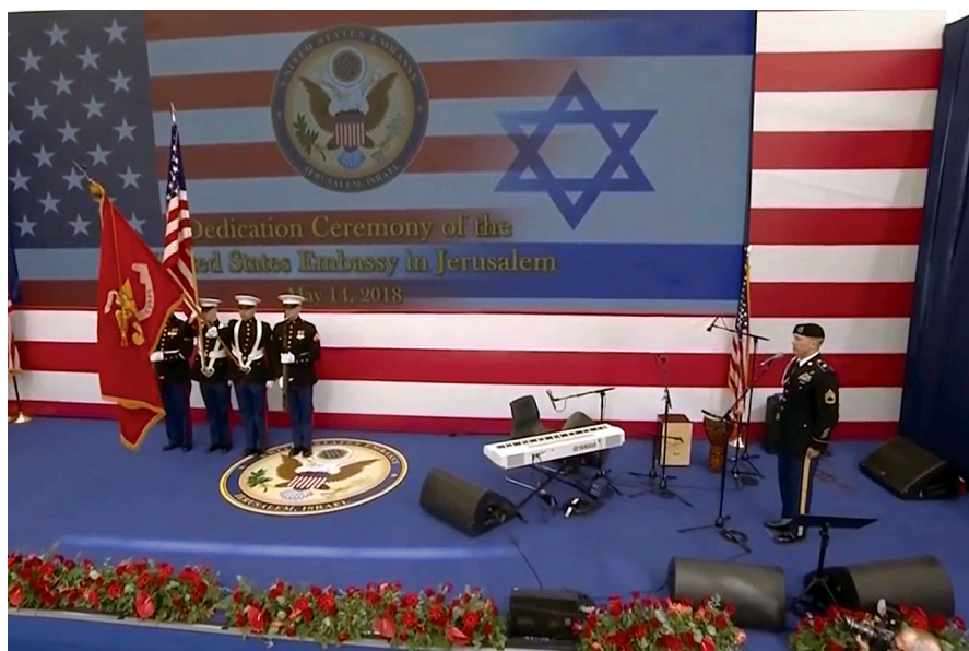
Fig. 1: Beginning of the ceremony, U.S. Opens New Embassy in Jerusalem After Trump's Decision to Recognize Capital (TIME 2018, 00:01:32).

space, conflict and the media. 4 More specifically, adopting a spatial approach to religion, it draws on this episode to consider media rituals in the construction of holy space within the Middle East conflict.