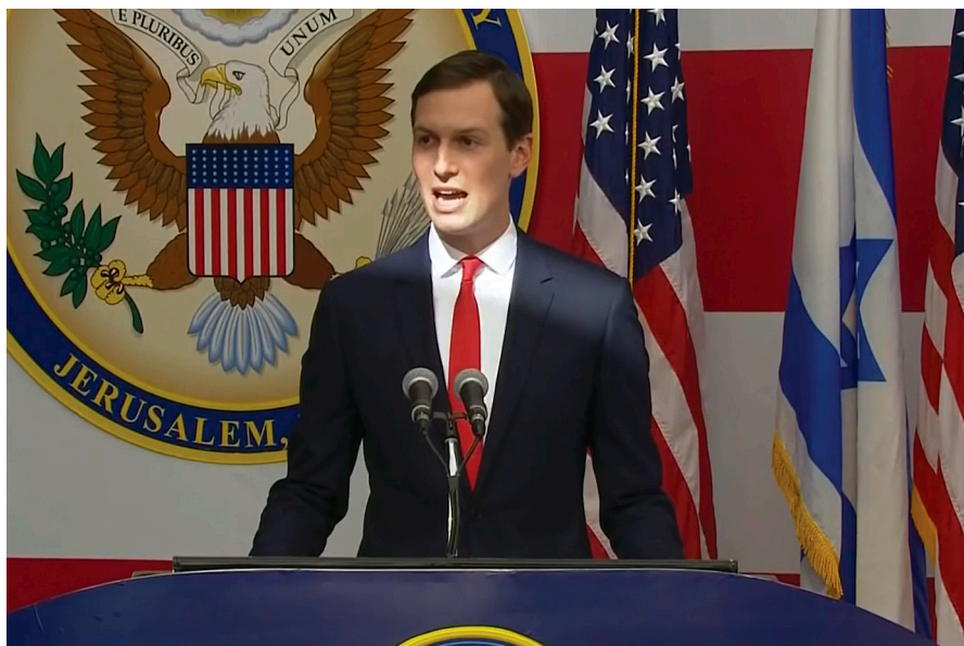
Fig. 4: Kushner, U.S. Opens New Embassy In Jerusalem After Trump's Decision To Recognize Capital (TIME 2018, 00:43:43).

Netanyahu draws a clear connection between biblical history and current events and ascribes them the same status. The religious reference here consists in the first place of an allusion to biblical history. The Bible and its authority are deployed to load Jerusalem in a certain way; the aligning of current events with the biblical Jerusalem endows them with the same authority. The eternal connection of the Jews with Jerusalem is emphasized, legitimizing their possession of the city. That “Jerusalem” is not necessarily the earthly Jerusalem, for the archaeological evidence casts doubt on the linkage, but rather the heavenly Jerusalem, which is a central longing in Judaism. The equation of the earthly Jerusalem with that heavenly Jerusalem ensures the latter becomes the rightful object of desire, and a rightful possession, in turn.