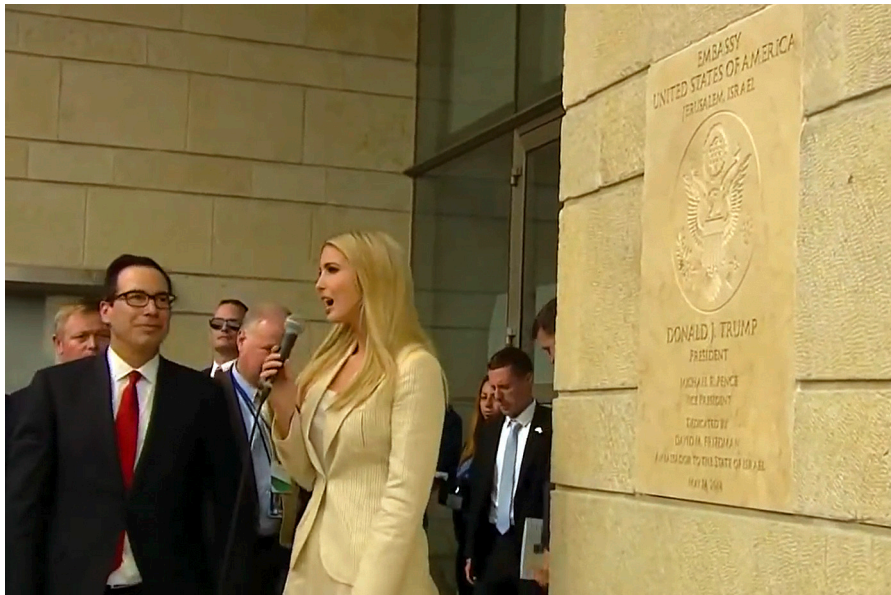
Fig. 2: Unveiling the seal, U.S. Opens New Embassy in Jerusalem After Trump's Decision to Recognize Capital (TIME 2018, 00:29:01).