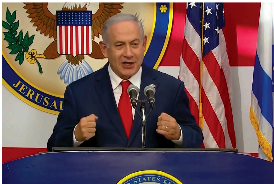
Fig. 3: Netanyahu, U.S. Opens New Embassy in Jerusalem After Trumps Decision to Recognize Capital (TIME 2018, 00:57:47).

Moreover, almost all the speakers refer to the history of Jerusalem, including its biblical origins. They look back over 3,000 years and stress that King David established Jerusalem as the capital of the Jewish people. On this point Prime Minister Benjamin Netanyahu's speech (fig. 3) is exemplary: