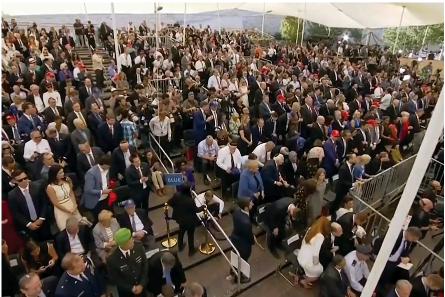
Fig. 9: Audience from above, U.S. Opens New Embassy in Jerusalem After Trump's Decision to Recognize Capital (TIME 2018, 00:40:55).