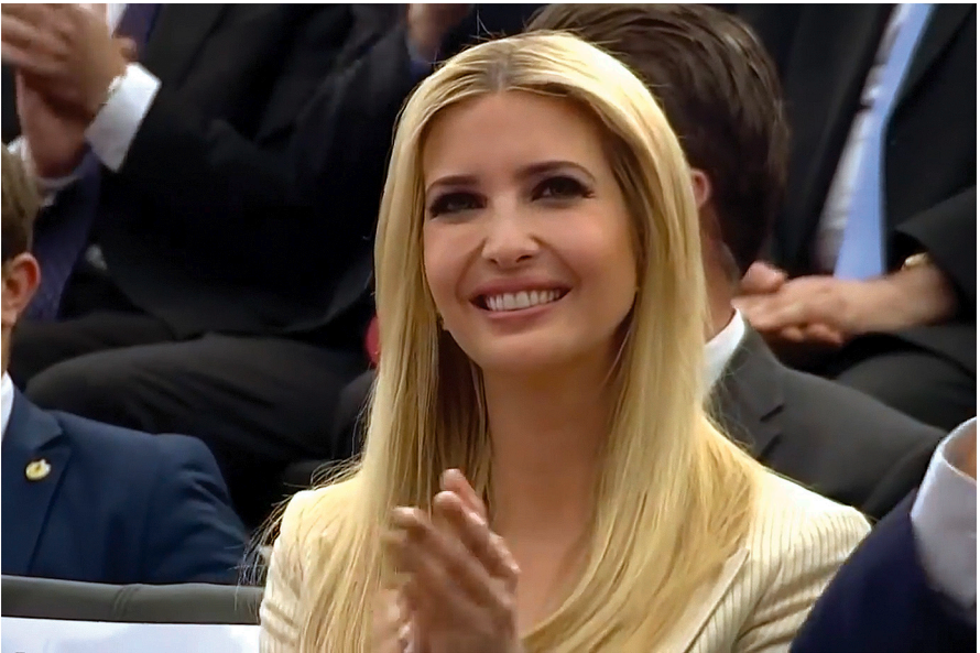
Fig. 11: Ivanka Trump, U.S. Opens New Embassy in Jerusalem After Trump's Decision to Recognize Capital (TIME 2018, 00:43:56).