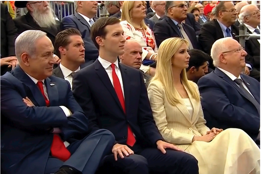
Fig. 10: Audience in close setting, U.S. Opens New Embassy in Jerusalem After Trump's Decision to Recognize Capital (TIME 2018, 00:13:05).