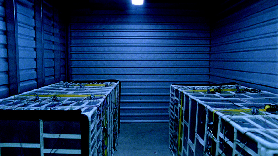
Fig. 2: The box. Film still, PRIMER (Shane Carruth, US 2004), 00:45:07.

with Granger, the pair's trust in one another (and in their own moral goodness) is called into question. As the narrative progresses, both the duo and the viewer realize that the diegetic timeline is fractured and overlapped, with multiple Aarons and Abes circling through events, causing everyone (both characters and audience) to lose their grip on what is happening. 31