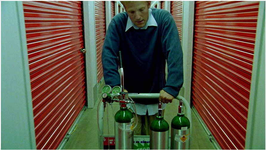
Fig. 3: Multiple timelines. Film still, PRIMER (Shane Carruth, US 2004), 01:14:04.

wanted it to be right on that line [...] The audience never knows more than Abe and Aaron know ... But “Primer” is airtight; the information is in there. No one’s shown me a hole yet. People who decide to see it a second time, a third, fourth, fifth time [...] they tell me it’s a different experience. 33