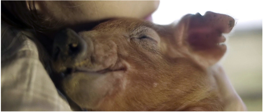
Fig. 6: Healing from trauma. Film still, UPSTREAM COLOR (Shane Carruth, US 2013), 01:33:56.

barricade themselves in their house and hide in a bathtub; we view them from an iconic God's eye shot, their limbs intimately intertwined, a linking of body and soul (fig. 5).