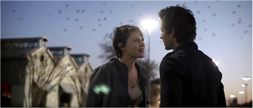
Fig. 4: "They could be starlings." Film still, UPSTREAM COLOR (Shane Carruth, US 2013), 01:00:07.