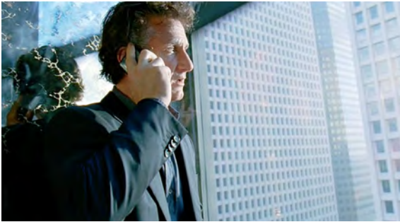
Figs. 3a-b: Father-son relational dynamics and the built environment of downtown Houston serve to invoke a sense of modern alienation in THE TREE OF LIFE (Terrence Malick, US 2011), 01:43:54; 00:15:34.

humans and nature, and what vision of politics should order that relationship? I have already noted that a kind of Augustinian soul-searching compels much of the film's progress. A combination of humans' disordered loves and the alienation which results therefrom has led to our fractured relationships with each other and with nature. This is imaged in the strained interpersonal dynamics between characters like Jack and his father, Mr. O'Brien (played by Brad Pitt). Similarly, the built environment of downtown Houston, with its impersonal symmetry, dramatizes Jack's overall sense of estrangement (see figs. 3a–b). As both a child and a grown man Jack is a stranger in a strange land. All this grounds THE TREE OF LIFE 's Augustinian theological rationale.