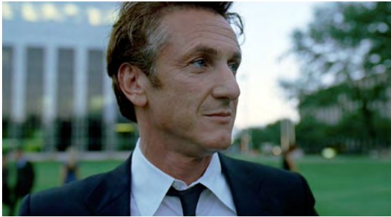
Fig. 6-b: Outside, Jack delights in the renewal of his vision (Terrence Malick, US 2011), 02:12:05; 02:12:12.

and history. Any instant, according to Emerson and his progeny, can transform the perceiver so as to help them see beyond established patterns of custom and habit. Exhilaration makes the familiar strange, instilling in the seer a vision of a new heaven and earth; heaven indeed has been realized in the seer's eyes. Furthermore, all sense of one's alienation from the world is removed at the moment of unitive epiphany. Emerson himself attests to this, noting in Nature how he sensed an "occult relation" begin to abide between him and other beings, so powerful was his own experience of ecstatic reverie. "I am not alone and unacknowledged", Emerson writes. The trees, the grass, and all other lifeforms constitutive of the biome "nod to me, and I to them". 23