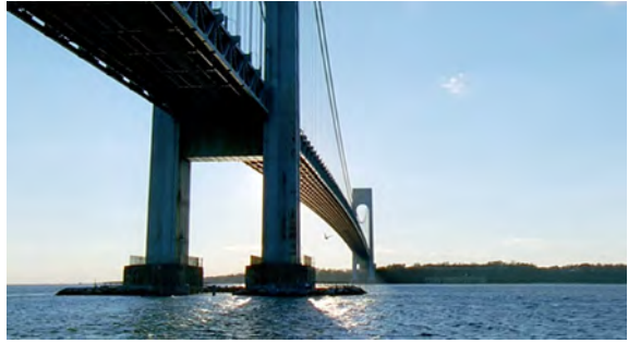
Fig. 7: The bridge in THE TREE OF LIFE 's final shot (Terrence Malick, US 2011), 02:12:26.

arating vision. “Whenever a mind ... receives a divine wisdom”, Emerson wrote at this point in his life, “old things pass away, – means, teachers, texts, temples fall; it lives now, and absorbs past and future into the present hour.” 29 Yet such experiences of revelation need not always lead one away from established forms of religious authority. They also can just as easily serve to affirm one’s commitment to institutional establishments, albeit with a renewed sense of an institution’s place and function in the world. Something like this occurred when John of Patmos received the vision that eventually became the book of Revelation, a text that has gone far in buttressing the church’s worldly significance. The prospective ends of revelatory vision, then, are not to be prioritized in experiences wherein exhilarating insight is acquired. Such ends are never predetermined; we rarely are able to tell exactly where revelation will lead. Instead, the simple willingness to remain open and available to ecstatic vision wherever it might find us – be it on a New England common, a remote Aegean island, or in a Houston business park – should be prized above all. This, I submit, is the basic religio-political vision Malick casts with THE TREE OF LIFE .