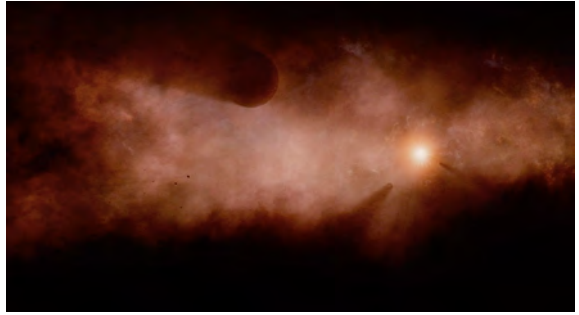
Fig. 2a-b: THE TREE OF LIFE juxtaposes the birth and progress of the physical universe with the more modest (but no less complicated) universe of the O'Brien family (Terrence Malick, US 2011), 00:23:03; 01:20:56.