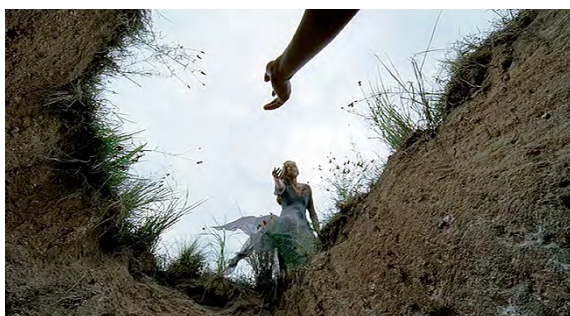
Figs. 1a–b: The dead emerge from their resting places in THE TREE OF LIFE 's finale (Terrence Malick, US 2011), 02:05:02; 02:05:16.

frameworks which bolster his philosophical inquiries. 9 For instance, THE TREE OF LIFE opens with an epigraph from the Book of Job (“Where were you when I laid the foundations of the earth? ... When the morning stars sang together and all the sons of God shouted for joy?” [Job 38:4,7]). Malick also utilizes Christian conceptual conventions like “nature” and “grace” to frame the relational dynamics between characters and the film’s overall structural organization. And finally, THE TREE OF LIFE is chock full of allusions to traditional Christian theological tropes (e. g., the film concludes with a rousing rendition of corporeal resurrection, set to the score of Hector Berlioz’s 1837 Requiem Mass; see figs. 1a–b). Given the frequency of such referential touch points, it is not surprising that most theological interpretations of THE TREE OF LIFE are patently Augustinian.