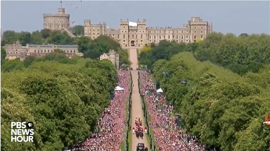
Fig. 1: Longshot from the air shows spectators lining the streets to celebrate the just-married couple (PBS, News Hour, 21 May 2018, 01:34:21). 1

On 19 May 2018 the royal wedding of Prince Harry and Meghan Markle flooded the television channels. Millions of spectators around the globe watched the event on screens and more than 100,000 people lined the streets of Windsor, England, to see the newly wed couple (fig.1). 2