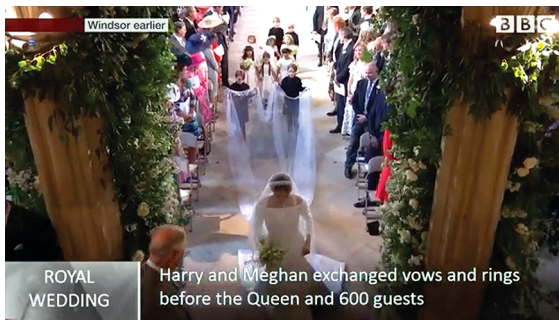
Fig. 4: From a high angle, the camera shows the bride and the flower bearers carrying her veil. The view underlines the nature of her walk to the altar, in part unaccompanied, and the threshold between the two spaces occupied by the invited guests: the first part as she walks down the aisle seen by a broader audience, and thus a semi-public space, and the second part seen by members of the royal family, the clergy, the choir, and few chosen guests, and thus a semi-private space (BBC News, Royal Wedding, Live from Windsor, 19 May 2018, 00:04:20). 6