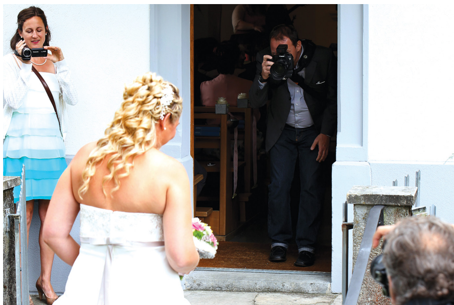
Fig. 2: The photographers need to catch every important moment during the wedding. Picture by Yves Müller, Zurich 2017.

pher, is founded on the desire to make this day unforgettable, even though for more than half the protagonists the contracts they seal come to an end before “death do them part”.