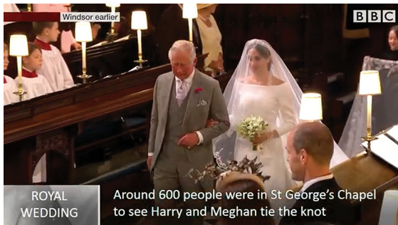
Fig. 5: As the bride's father was absent, Prince Charles escorted Markle down the aisle and up to the altar, almost as he were granting her official access to this semi-private space of a most privileged family (BBC News, Royal Wedding, Live from Windsor, 19 May 2018, 00:04:45). 7

The television coverage of the ceremony at St. George's Chapel enabled the viewing of semi-private spaces. The camera view provided privileged access to central moments of the ritual, for example when the bride entered the chapel by herself (fig. 4), when Prince Charles, her future father-in-law, escorted Markle from half way down the main aisle to the altar (fig. 5), or when vows were made during the ceremony within the church (fig. 6).