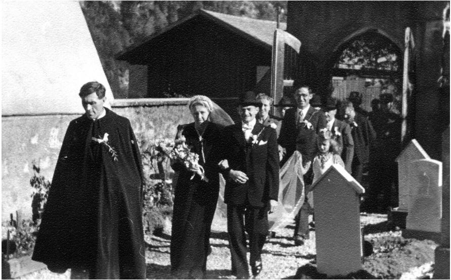
Fig. 10: Black bridal-gowns were normal in the 19th and early 20th centuries. We see here a rural wedding in Grisons, Switzerland, from the 1940s. The pastor walks in front, followed by the bride and groom with a flower girl, and then the guests.

We have observed in relation to the categorization of the private and the public that the media play a crucial role, and their role is also vital for the interaction of tradition and innovation. Traditions are formed through media communication, but at the same time media can make innovation possible, sometimes even defining something as innovative although it is not as novel as people might think. Again the white wedding dress is a good example: after Queen Victoria's wedding, fashion magazines (popular culture media) began to promote white bride-dresses, but it would be another 100 years before the white wedding gown was accepted all over Europe and in the USA. 16 Today TV series, films, or the internet tell their consumers that the coloured or black wedding dress is innovative, and yet it was common up until the 20th century.