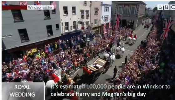
Fig. 3: On the right spectators are extending their arms, smartphones in hand, to catch the moment of the couple's appearance (BBC News, Royal Wedding, Live from Windsor, 19 May 2018, 00:45:56). 5