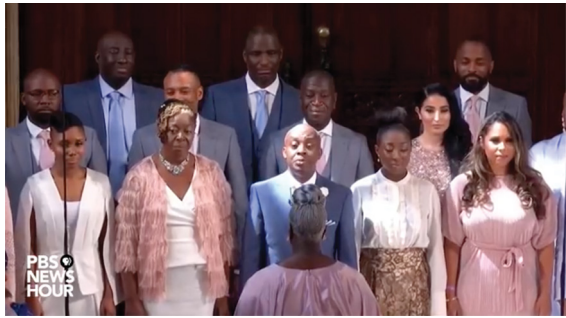
Fig. 9: Kingdom Gospel Choir performs at the wedding of Meghan Markle and Prince Harry (PBS, News Hour, 21 May 2018, 00:38:50). 11

Austria (and, we would argue, also in the rest of Europe) are designed by paid wedding planners as idealistic and individualistic rituals, the sequence that is followed in the preparation and the ritual itself is highly standardized, although open to individual adaptations. 12