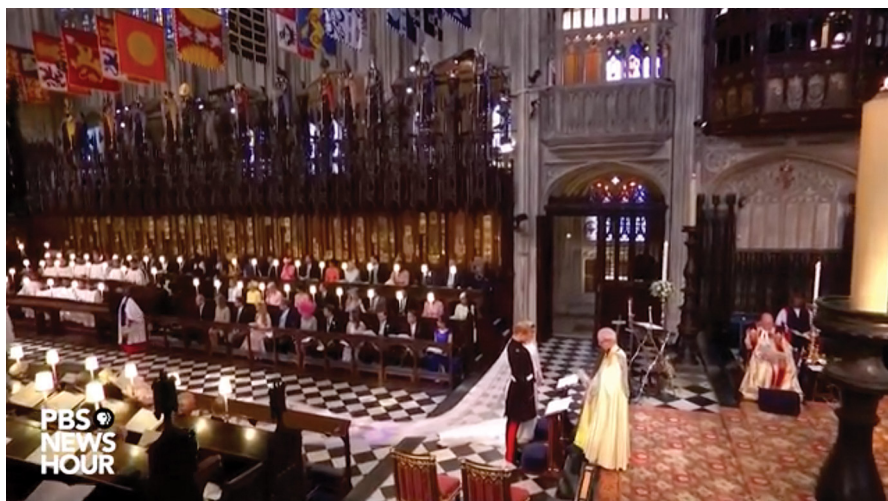
Fig. 12: The religious setting of the royal wedding (PBS, News Hour, 21 May 2018, 00:47:18). 20