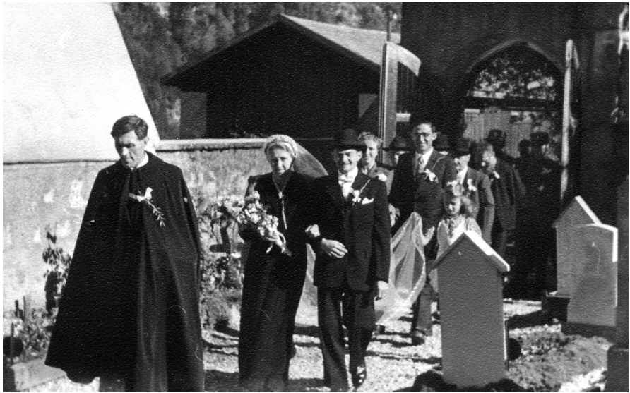
Fig. 10: Black bridal-gowns were normal in the 19th and early 20th centuries. We see here a rural wedding in Grisons, Switzerland, from the 1940s. The pastor walks in front, followed by the bride and groom with a flower girl, and then the guests.

We have observed in relation to the categorization of the private and the public that the media play a crucial role, and their role is also vital for the interaction of tradition and innovation. Traditions are formed through media communication, but at the same time media can make innovation possible, sometimes even defining something as innovative although it is not as novel as people might think. Again the white wedding dress is a good example: after Queen Victoria's wedding, fashion magazines (popular culture media) began to promote white bride-dresses, but it would be another 100 years before the white wedding gown was accepted all over Europe and in the USA. 16 Today TV series, films, or the internet tell their consumers that the coloured or black wedding dress is innovative, and yet it was common up until the 20th century.