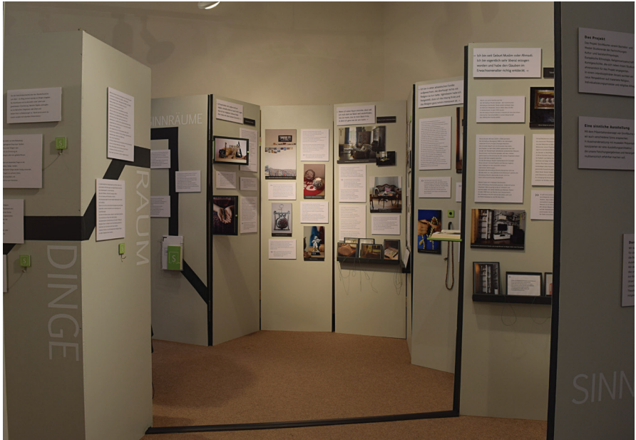
Fig. 1: Exhibitionview, SinnRäume

courses on the individualization and privatization of religion were also applied in our interdisciplinary methodology, as were spatial theoretical reflections on private space and corresponding religious concepts of life and living together. The results of our deliberations were contextualized in the terms and concepts of religious studies and made tangible in the form of texts, images, and quotations from the interviews (Fig. 1).