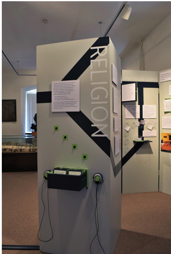
Fig. 3: Exhibition view on the Panels: Religion, A transparent Exhibit, Esther, Markus, Photography by Nikolas Magin © SinnRäume

The exhibition also shows how meanings and definitions are created and how they can change. This is reflected in the design of the object descriptions in the showcases. The loan objects came from the homes of our interviewees. The respective descriptions include standard data on size and origin, but this information is augmented by statements on the subjective meaning of the objects and in one case on the process by which a member of our project team collected contextual data on that specific object.