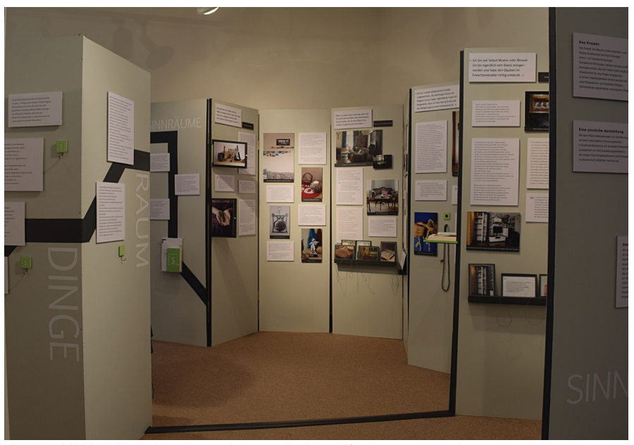
Fig. 1: Exhibitionview, SinnRäume

courses on the individualization and privatization of religion were also applied in our interdisciplinary methodology, as were spatial theoretical reflections on private space and corresponding religious concepts of life and living together. The results of our deliberations were contextualized in the terms and concepts of religious studies and made tangible in the form of texts, images, and quotations from the interviews (Fig. 1).