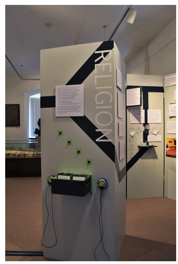
Fig. 3: Exhibition view on the Panels: Religion, A transparent Exhibit, Esther, Markus, Photography by Nikolas Magin © SinnRäume

exhibition The also shows how meanings and definitions are created and how they can change. This is reflected in the design of the object descriptions in the showcases. The loan objects came from the homes of our interviewees. The respective descriptions include standard data on size and origin, but this information is augmented by statements on the subjective meaning of the objects and in one case on the process by which a member of our project team collected contextual data on that specific object.