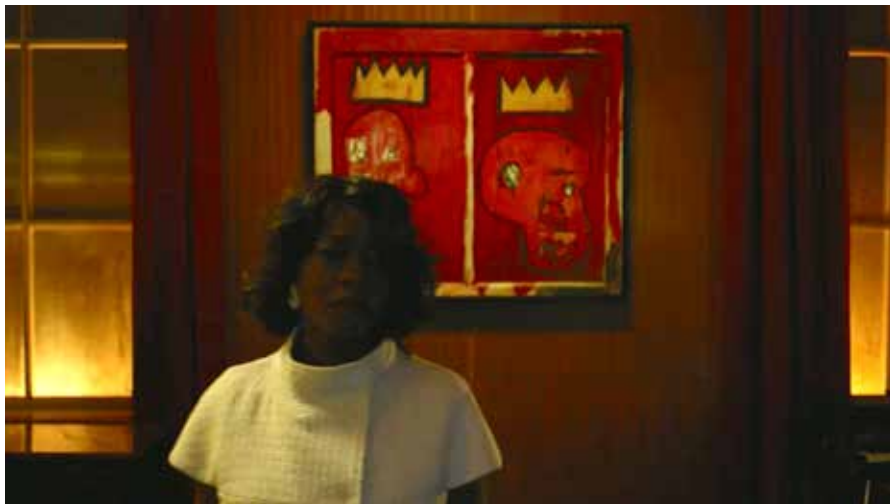
Fig. 12: Mariah ascending. Film still, "You Know My Steez", LUKE CAGE (2016), S01/E13, 42:08.

There is also the tragedy and complexity of Mariah's childhood sexual abuse, for which Cornell ultimately pays. Her crazed reaction to Cornell's accusation that she "wanted it" is multivalent (E07). On one hand, her powerful denial of the accusation offers a clear demonstration of how inaccurate and self-serving the cultural commonplace of blaming victims is. On the other hand, her actions afterward also reinforce the stereotype that abused women are crazy and dangerous. 45 Further, her character arc does not challenge the trope, fodder for exploitation films galore, that requires that women be raped before they are socially sanctioned or morally excused for mobilizing their own power as physical violence. Finally, there is also the last scene with Shades, who has just fallen in love with Mariah as a result of her violence, when she echoes her words to Cornell, "I did not want this", and Shades replies, "I think you did." What do we do with the juxtapositions that such an assault narrative provides in the context of rape culture?