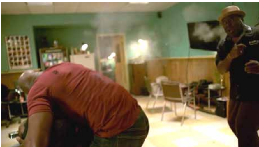
Fig. 4: Film still, "Code of the Streets", LUKE CAGE (2016), S01/E02, 42:31.

There are other ways in which Luke submits to violence of different types, rather than leading with his fists. When his landlords are being threatened, he first asks the four men to stop being disrespectful, and then stands still while one of them hits Luke in the face and shatters his own hand (E01). 5 After Cornell threatens to expose Luke as a fugitive, he decides to leave Harlem, before Claire convinces him to stay and fight back (E07). He tells the two officers who stop him that he just wants to walk and mind his own business (E09). Despite his innocence he does not resist being taken back to prison at the end of the series (E13). Even during his climactic battle with Diamondback, who is wearing a suit that makes him at least as strong as Luke, he simply decides to stop trading blows: "I'm not doing this any more. . . . You want me dead? Then kill me" (E13). 6