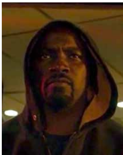
Fig. 10: Film still, “Moment of Truth”, LUKE CAGE (2016), S01/E01, 52:46.

And then, of course, the show several times goes out of its way to tell us directly that Luke is a Christ-figure. When he confronts Cornell after surviving the mis-