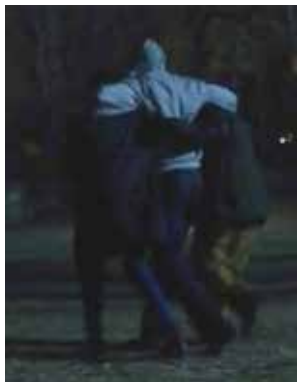
Fig. 5: Film still, "DWYCK", LUKE CAGE (2016), S01/E09, 41:49.

experiment explodes, giving Luke his powers and leading everyone to think he is dead (E04); 16 and when he appears to actually die for a moment while being treated for the Judas wounds but is brought back to life when Claire throws a live electrical hot plate into the acid bath that contains him (E10).