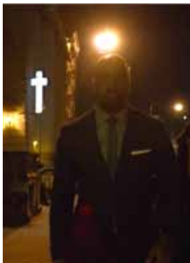
Fig. 6: Film still, "Just to Get a Rep", LUKE CAGE (2016), S01/E05, 48:47.