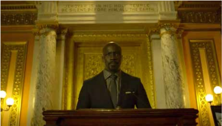
Fig. 11: Film still, “Just to Get a Rep”, LUKE CAGE (2016), S01/E05, 44:46.

With these understandings in mind, we can see Luke as a sacred, secular, and profane hero. An example of this trinary perspective is provided when he speaks at Pop’s funeral (E05; fig. 11). Luke is in a conventionally sacred space, a church,