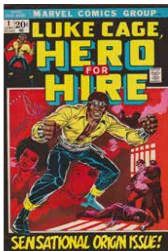
Fig. 2 (l.): John Romita Sr., cover artwork, Luke Cage, Hero for Hire #1 (June 1972) © Marvel Comics.