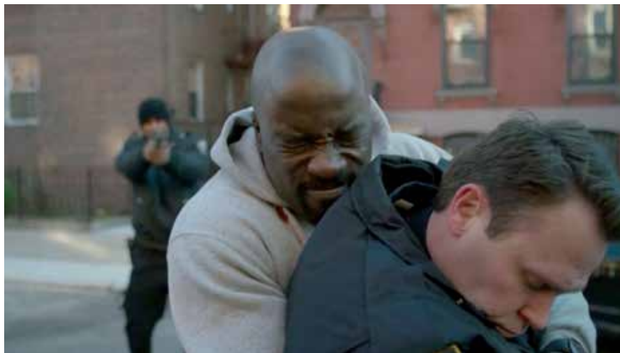
Fig. 1: Film still, "DWYCK", LUKE CAGE (2016), S01/E09, 19:10.

With this sense of timeliness in mind, members of the AAR's Religion, Film, and Visual Culture (RFVC) group approached the director of the annual meeting, Dr. Robert Puckett, about scheduling a last-minute roundtable discussion of the first season of the superhero series LUKE CAGE (Netflix, US 2016), released in October 2016. 1 Not only is Luke the first Black superhero to be featured in his own comic book and his own television show, but the Netflix portrayal of him in a hoodie, being shot at by police (fig. 1), was clearly meant to resonate instantly with critically important, and deeply troubling, of-the-moment occurrences. He is, in the words of Rolling Stone 's Rob Sheffield, "the first Black Lives Matter superhero". 2