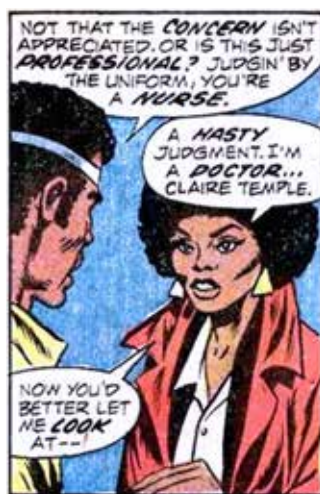
Fig. 3 (r.): George Tuska, interior artwork, Luke Cage, Hero for Hire #2 (August 1972) © Marvel Comics.