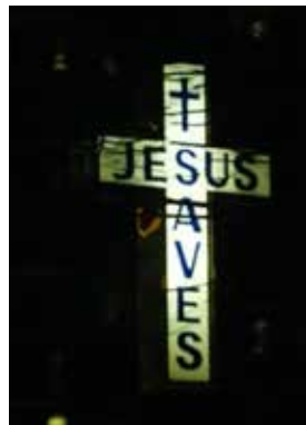
Fig. 7: Film still, "You Know My Steez", LUKE CAGE (2016), S01/E13, 43:35.