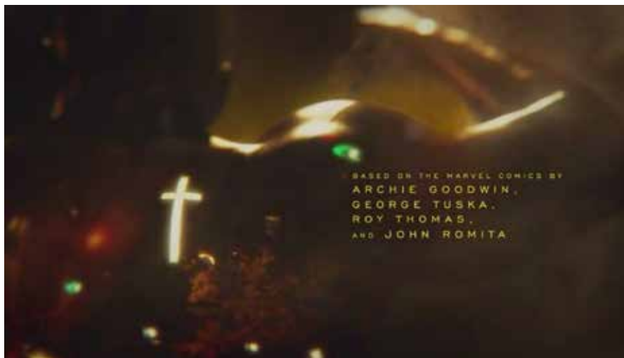
Fig. 8: Film still, opening credits, LUKE CAGE (2016).