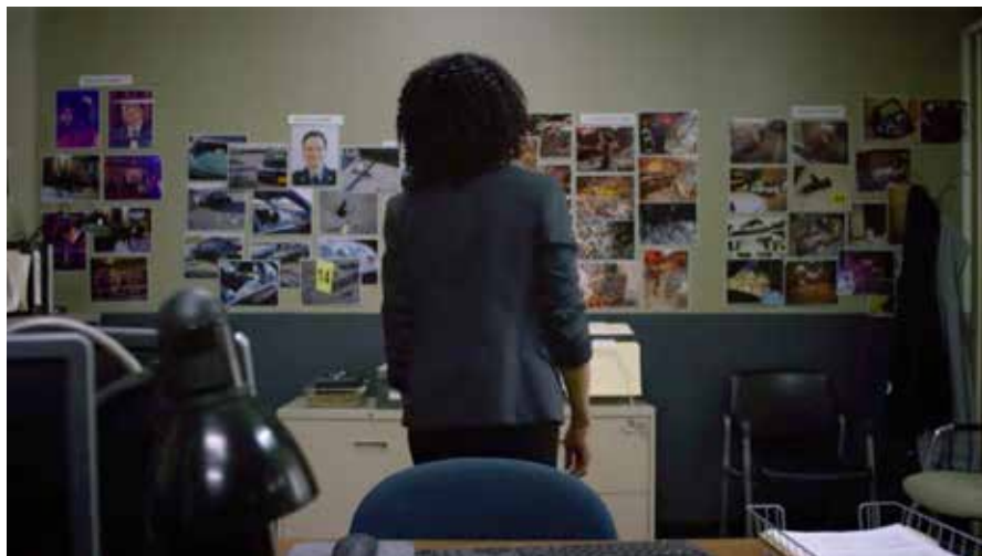
Fig. 16: Misty tries to see the whole picture. Film still, "Manifest", LUKE CAGE (2016), S01/E07, 10:45.

is intended to provide a kaleidoscope of different perspectives, each lens allowing us to see new pieces and shifting our vision of the whole.