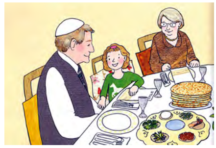
Fig. 16: Representing the grandmother's Muslim identity in Taufiq/Spanjardt (illust.), Huda bekommt ein Brüderchen (n. pag.) © Carlsen Verlag GmbH, Hamburg 2011.

Fig. 17: Jewish fashion and clothing in Halberstam/Späth (illust.), Lena feiert Pessach mit Alma (n. pag.) © Carlsen Verlag GmbH, Hamburg 2011.