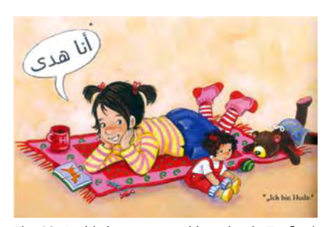
Fig. 10: Arabic language and lettering in Taufiq/Spanjardt (illust.), Huda bekommt ein Brüderchen (n. pag.)

lar group, on the one hand, and to form the sense of belonging to the community, on the other.<sup>24</sup>