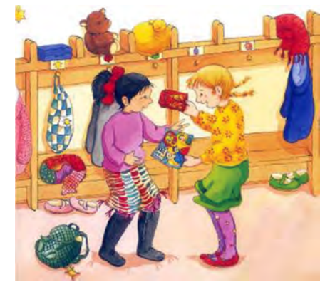
Fig. 2: Spaces and settings in Yu-Dembski/ Leberer (illust.), Lili und das chinesische Frühlingsfest (n. pag.) © Carlsen Verlag GmbH, Hamburg 2011.

Most of the stories are not set in Germany explicitly, but the use of the German language, the narrative perspective evident, for example, in "the Chinese are celebrating spring festival"<sup>20</sup> and the description of the environment suggest Germany or another German-speaking country. In particular, the illustrations show scenes commonplace in Germany. Most of the stories about migration