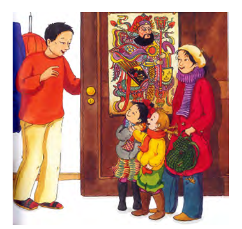
Fig. 14: Interior design in Yu-Dembski/Leberer (illust.), Lili und das chinesische Frühlingsfest (n. pag.) © Carlsen Verlag GmbH, Hamburg 2011.

The stories "Lena feiert Pessach mit Alma" and "Lili und das chinesische Frühlingsfest" represent religious otherness too (fig. 13–14).