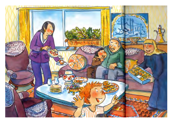
Fig. 12: Representation of Muslim identities in Halberstam/Tust (illust.), Levent und das Zuckerfest (n. pag.) © Carlsen Verlag GmbH, Hamburg 2011.

The illustrations of tableware and cooking utensils along with the interior design represent material culture and visualise own and foreign identities. The objects depicted are often accompanied by religious symbols. Levent's Turkish background is evident from the many postcards from Turkey, posters with football players wearing the shirts of the Turkish national team, a doormat with the inscription "Merhaba" and an alarm clock in the shape of a mosque. An image of the Basmala "האש - עלו יה שעלו האשף" ("In the name of Allah, the Most Gracious, the Most Merciful") decorates his grandparents' living room (fig. 12).