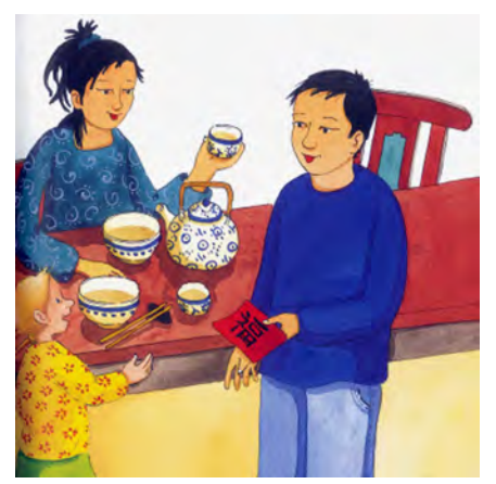
Fig. 9: Emma perceives Chinese letters as "strange signs" in Yu-Dembski/Leberer (illust.), Lili und das chinesische Frühlingsfest (n. pag.) © Carlsen Verlag GmbH, Hamburg 2011.