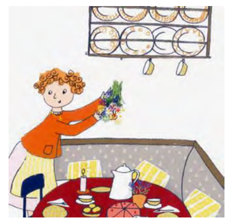
Fig. 11: Customs and traditions in Pana/ Bandlow (illust.), Jana und Teresa feiern Himmelfahrt (n. pag.).

Those characters that represent own identities often visit the characters that represent foreign identities on religious holidays to learn about traditions and rituals. Each narration informs the reader about particular dishes that are prepared and eaten in specific foreign countries. The authors compare traditional dishes with food the reader may know: "Family Wang